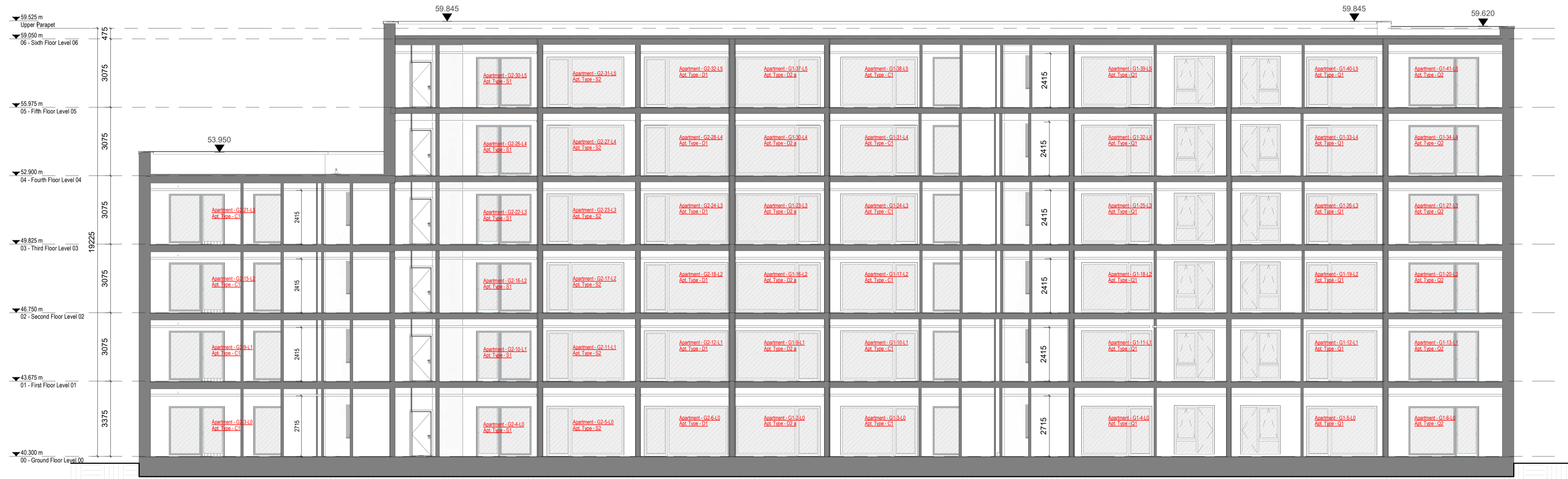
1 GA - Section DD 1 : 100